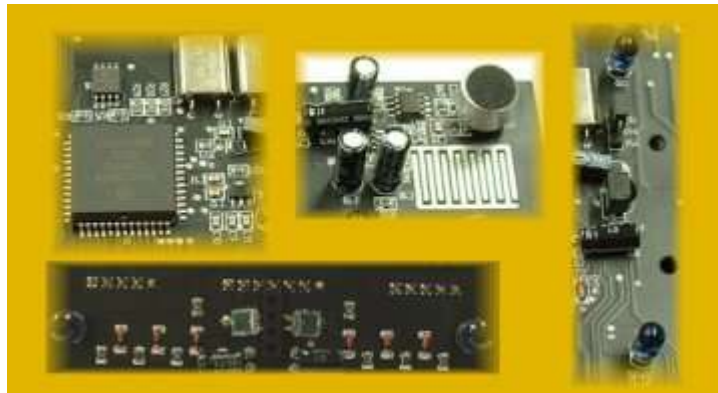
picture3: onboard sensors

To get information about the robots environment it is possible to connect a lot of different sensors.